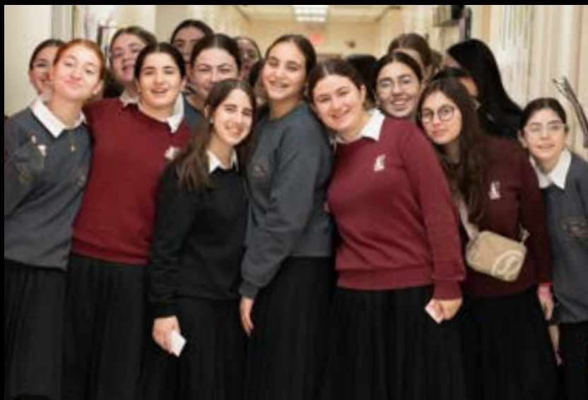
Talmidos of Bnos Menachem of Crown Heights.

“I am interested to know — are the children from Anash sheyichyu who are of schooling age learning in Chabad schools? The brachah and ruach of our Nesi'im is particularly there 2 .”